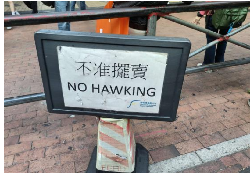
A sign reading “NO HAWKING” is placed next to the area where Pakistani stay.

Flea market is forbidden in Tai Nan Street. Policemen patrol frequently to stop the peddlers from selling products. Poor peddlers have to play the game of cat and mouse with the policemen in order to make a living. One Pakistani peddler told us that they have to quickly pick up their goods when they get a glimpse of policemen, they can only put them back and restart to sell when the policemen are gone.