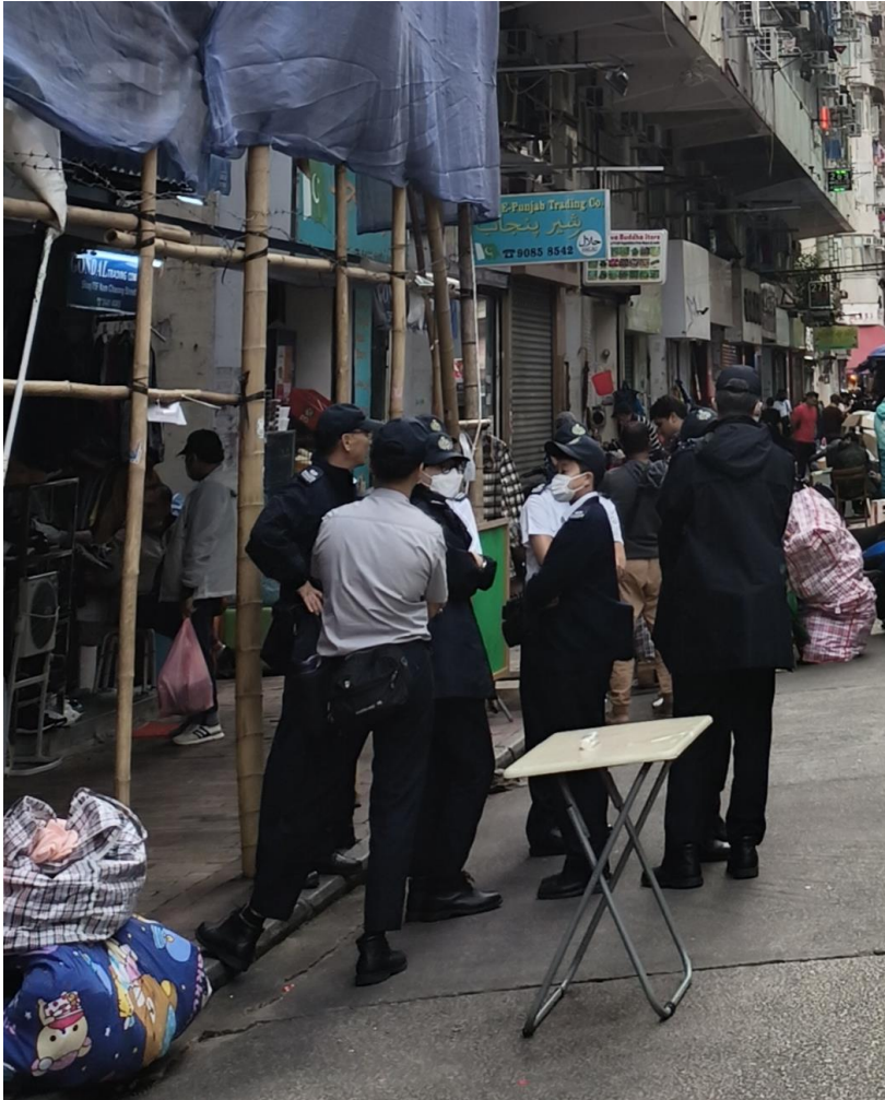
The police are coming, the business is in suspension.